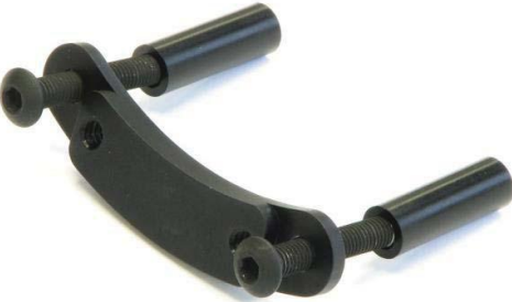
Quiver Attachment Bracket